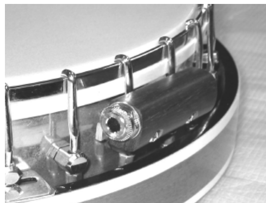
New Rosewood Bodied Jack Assembly